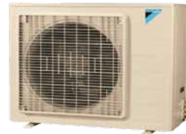
RR20 - 36AV1K RR36-50AY1K