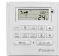
BRC51A62 Wired Remote Control